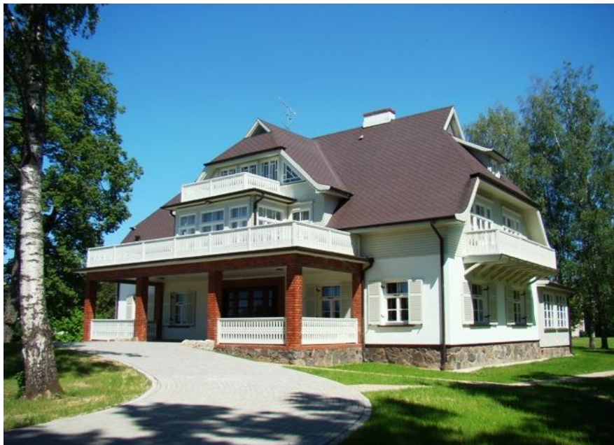
One of the buildings on the RATNIEKI hotel grounds